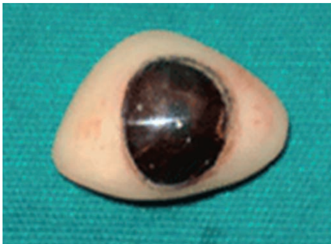
Fig. 6: Finished scleral blank