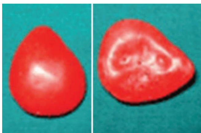
Fig. 4: Wax patterns