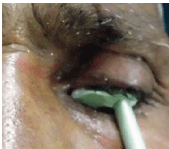
Fig. 2: Impression making with syringe tip