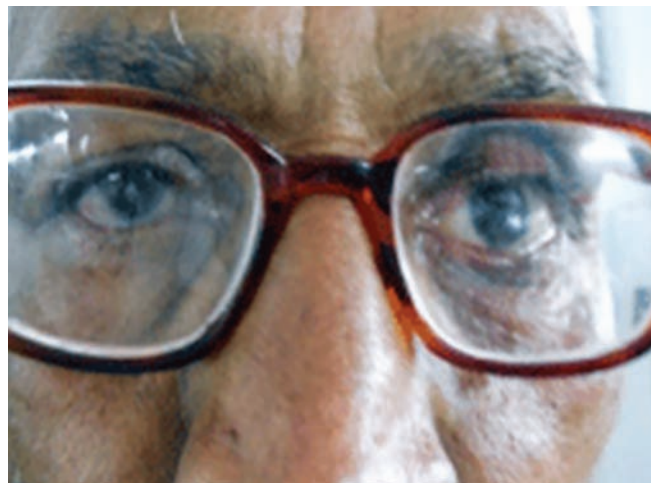
Fig. 7: Final prosthesis placed in ocular defect

is esthetically superior. This is so as an impression of the tissue bed of the patient is obtained prior to fabrication. 6-9 Direct impression was made of the tissue bed with addition silicone elastomeric impression material (Aquasil, Dentsply). This was a discourse from usual procedures of fabrication of custom tray to obtain the impression. 1,2,4,6-9 Traditionally, ocular prosthesis has incorporated the hand-painted iris into the prosthesis. Fernandes et al 3 had concluded in their study of 40 paint samples that all paints underwent alteration over time, with oil paint presenting the highest resistance to accelerated aging. However, digital reproduction of the iris is possible now with advanced photographic methods. Artopoulou et al 6 in their case report have discussed at length about the procedure for reproducing the patient's iris by digital photography. This procedure was adapted for the current case. Ocular button was not used to place the iris; instead, it was positioned directly on the scleral blank and secured with cyanoacrylate. This procedure conserves time, making the fabrication of the ocular prosthesis a day procedure.