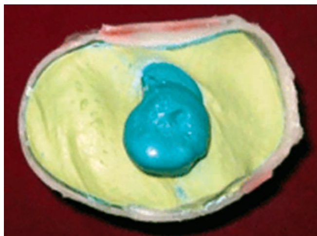
Fig. 3: Impression of the ocular defect